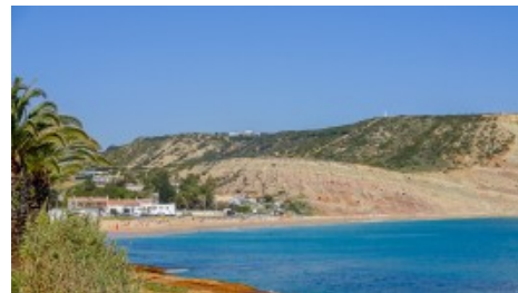
Praia da Luz