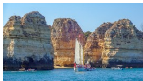
Lagos Ponta da Piedade