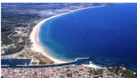
Lagos Meia Praia