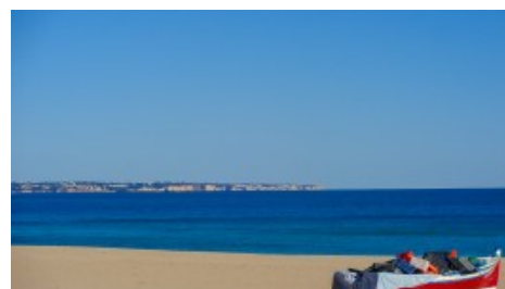
Lagos Meia Praia