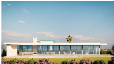
Possible Villa Project