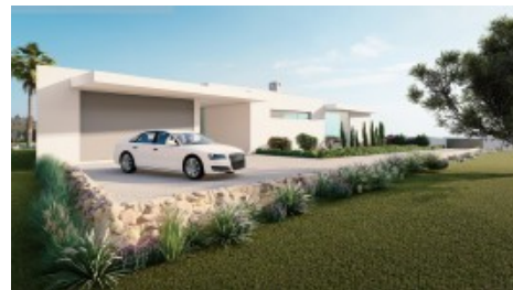
Possible Villa Project