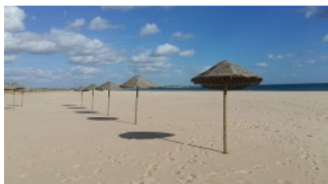
Meia Praia Beach