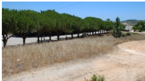
Plot 105 South East aspect