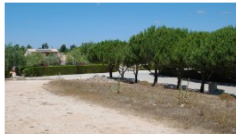
Plot 107 North East aspect