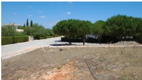
Plot 107 East North East aspect