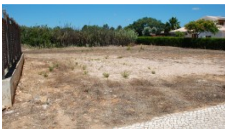
Plot 117 North aspect