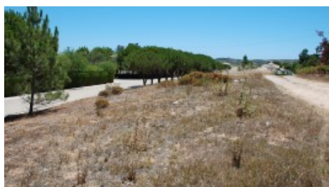
Plot 107 South East aspect