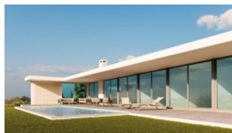
Front of property