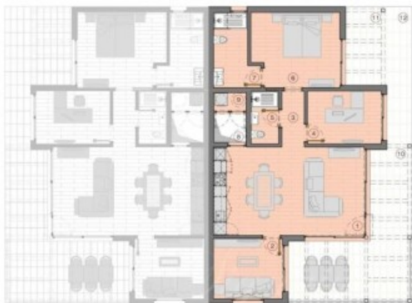
DF1 Floor Plan