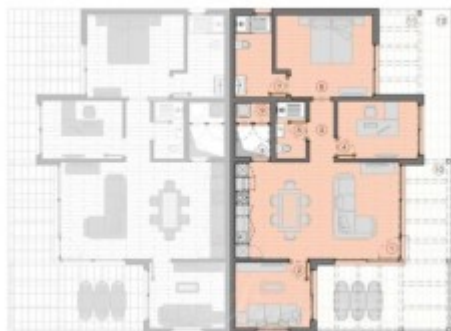
DF1 Floor Plan