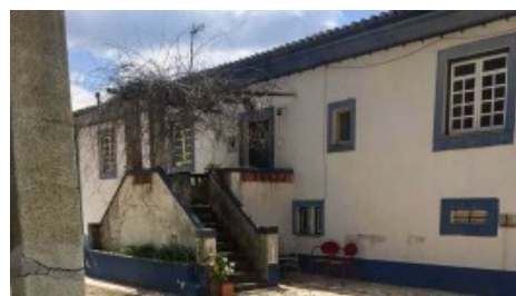
Front of property