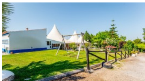
Children's play area