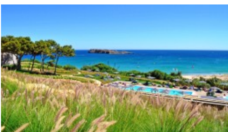
Beach Club Pool