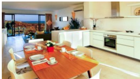
Living area and Kitchen