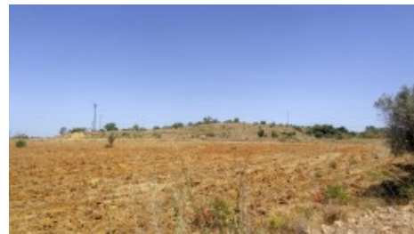
Land on other side of Road