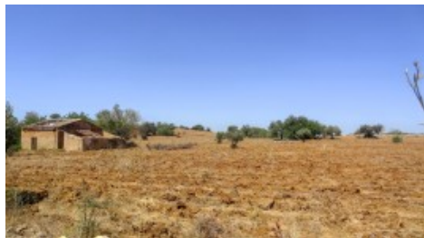
Plot & Ruin