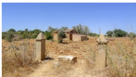
Entrance to Plot