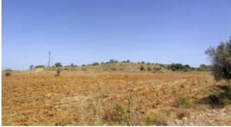
Land on other side of Road