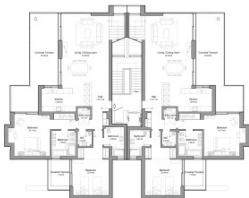
TV1835 Floor plans Penthouse 1st floor