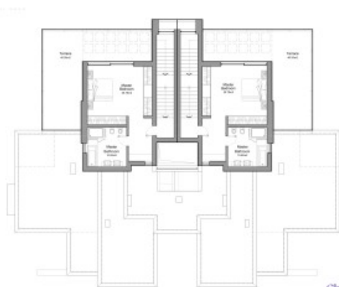
TV1835 Floor plans Penthouse top floor