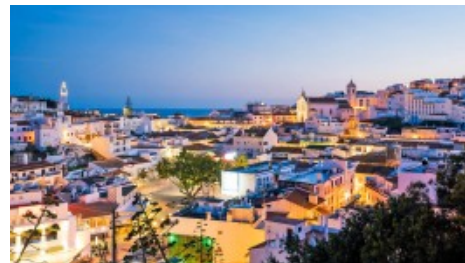
Albufeira at Night