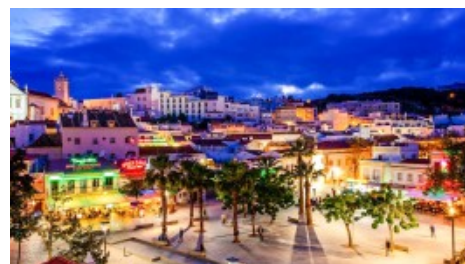
Albufeira at Night