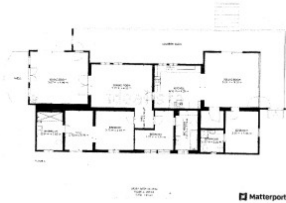
AT2158 Floor plan