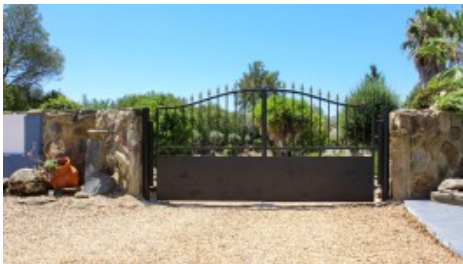
Gate to garden