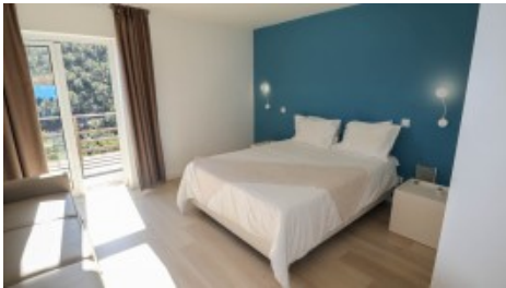
Bedroom - First Floor