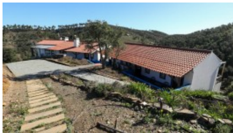
Rear of property