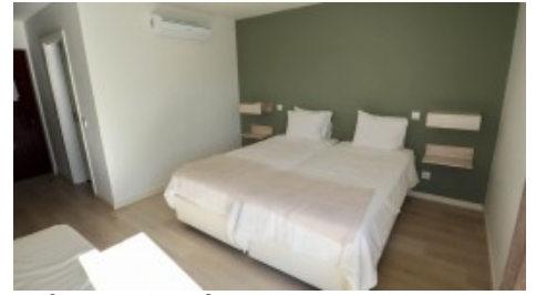
Bedroom - First Floor