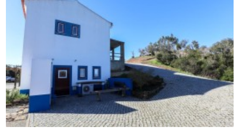
Rear of property