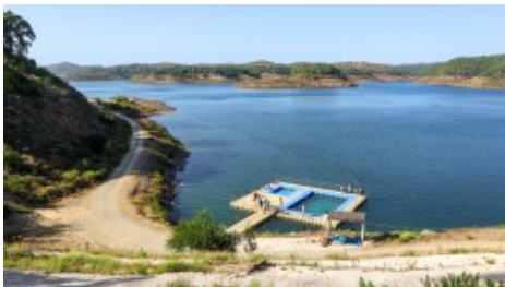
Santa Clara River Beach