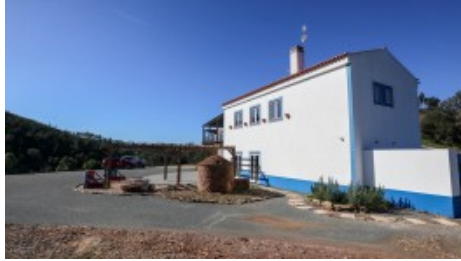
Side of property