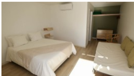
Bedroom - First Floor