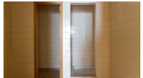
Staff shower room