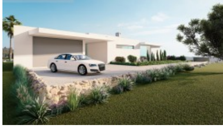
Possible Villa Project