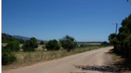
View of Monchique