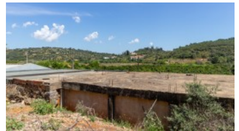
Rear of property