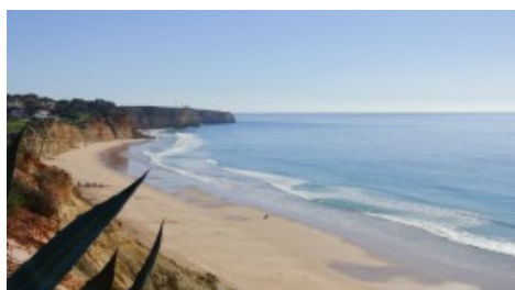
Porto de Mós beach