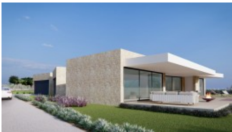
Side of property