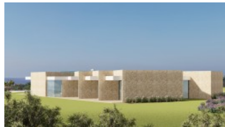
Side of property