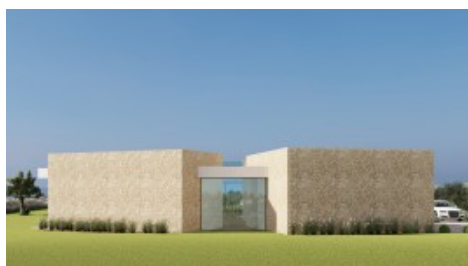
Rear of property