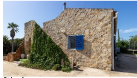
Side of property