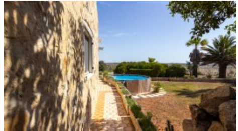
Side of property