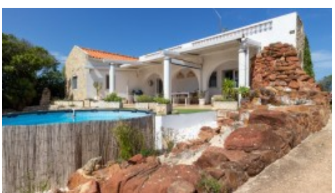
Countryhouse & Pool