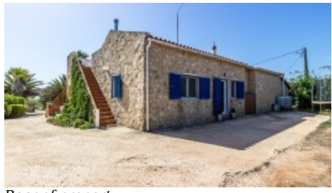
Rear of property