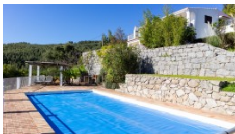
Terrace & Pool