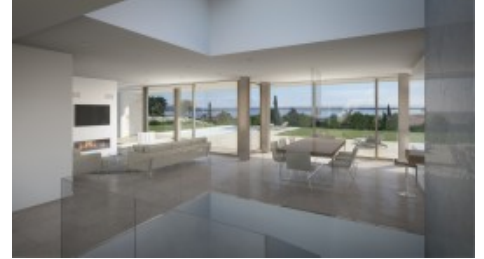
Dining/ Living Area example