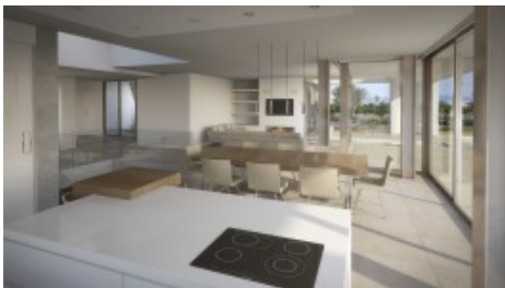
Dining Area example