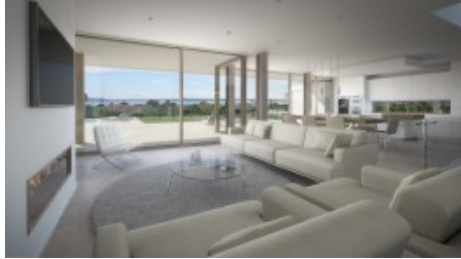
Living Area example