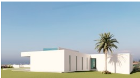
Side of property