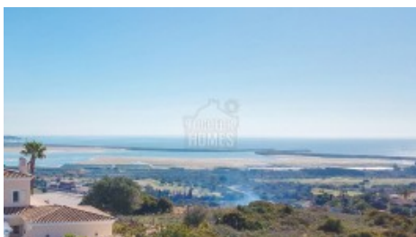
Location & Sea