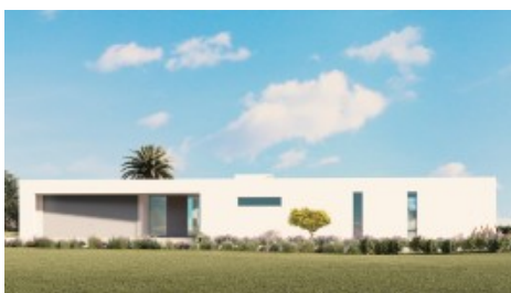
Side of property