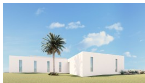
Rear of property