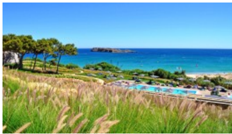
Beach Club Pool