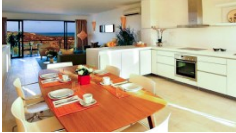
Living area and Kitchen