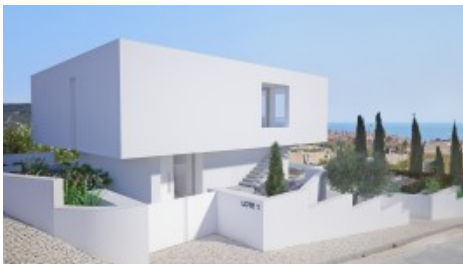
Side of property