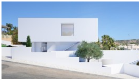
Side of property