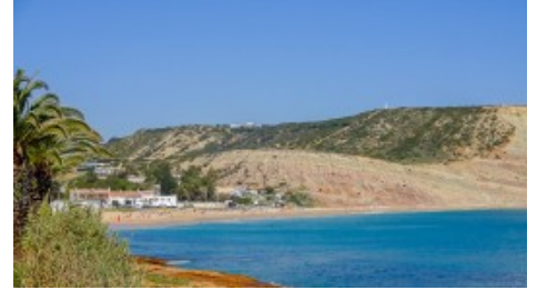
Praia da Luz