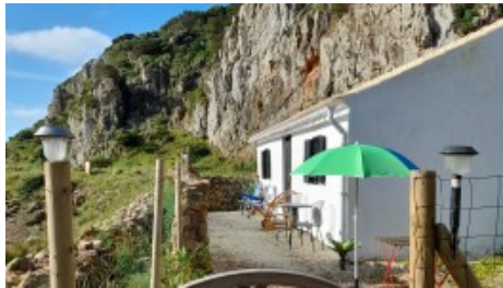
Front of property