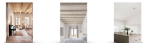
Wall finishes examples