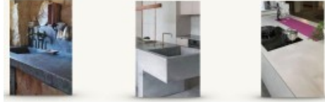
Kitchen finishes examples