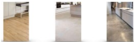
Floor finishes examples