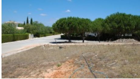
Plot 107 East North East aspect