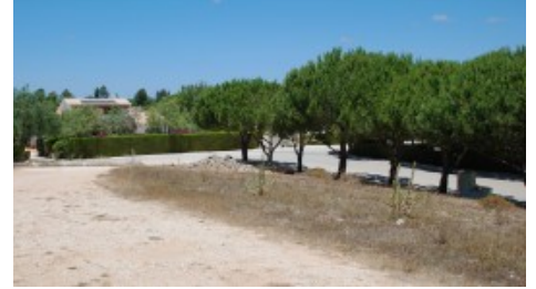
Plot 107 North East aspect