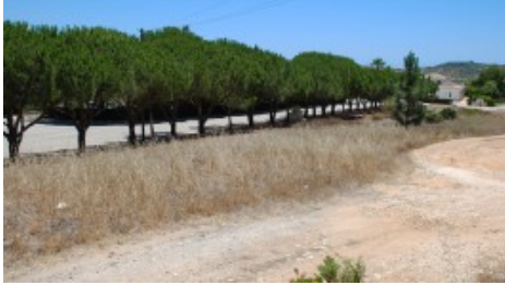
Plot 105 South East aspect