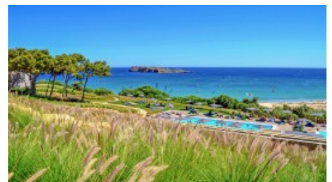
Beach Club Pool