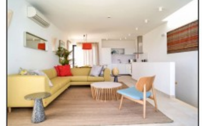
Kitchen & Lounge