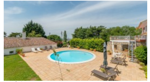
Pool & Terrace