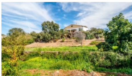
Front of property