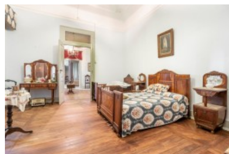
Bedroom 2 - First Floor