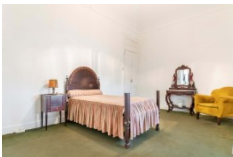
Bedroom - Ground Floor