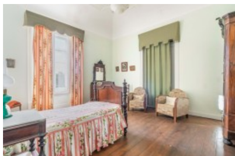
Bedroom 3 - First Floor