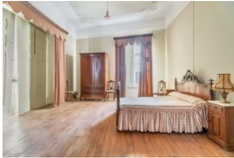
Bedroom - First Floor