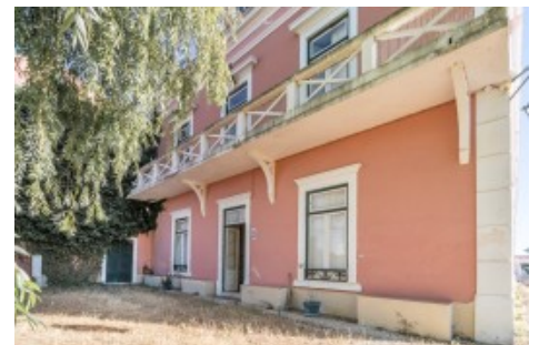
Rear of property