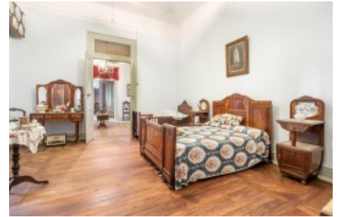
Bedroom 2 - First Floor