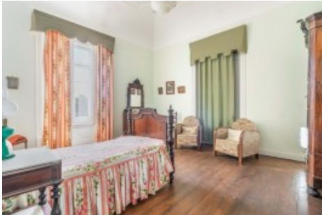
Bedroom 3 - First Floor