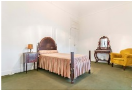
Bedroom - Ground Floor