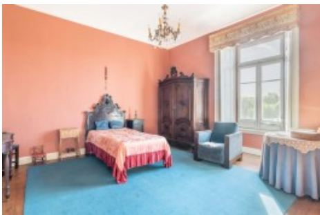
Bedroom - Ground Floor