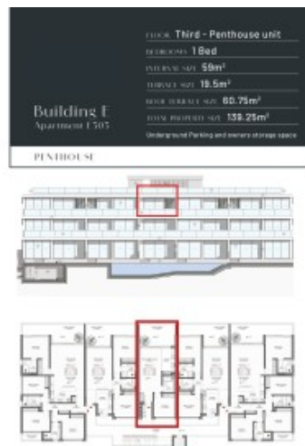
E303 T1 Penthouse Floor Plan 1