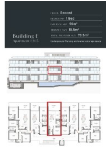
E203 T1 Floor Plan