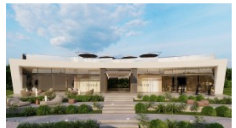
Gym & Yoga