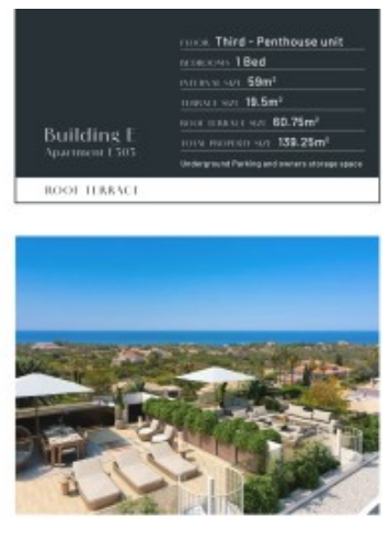
E303 T1 Penthouse Floor Plan 2