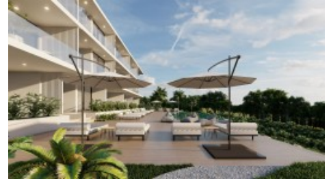
Terrace & Pool