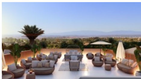
Roof top Tapas Bar