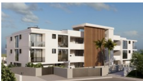
Rear of building