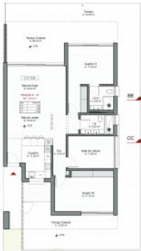
E101 T3 Floor Plan