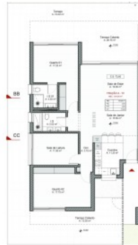
E105 T3 Floor Plan