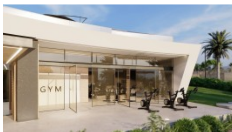
Gym & Yoga