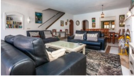
Lounge / Dining