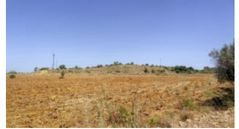
Land on other side of Road