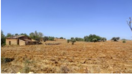
Plot & Ruin