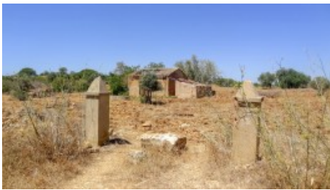
Entrance to Plot