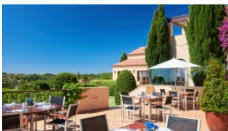
The Grill Terrace