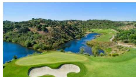
Jack Nicklaus North