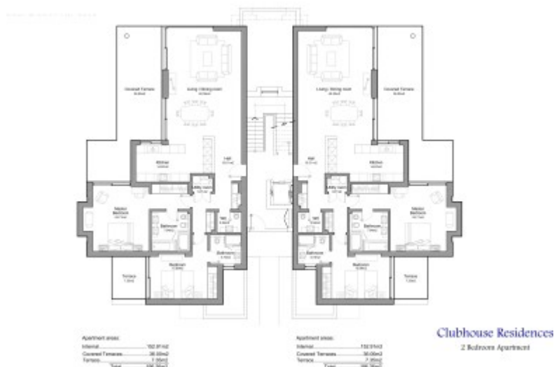
Floor plans 2 bedroom apartment