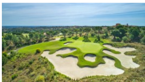
Jack Nicklaus North