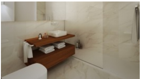
Bathroom - Example