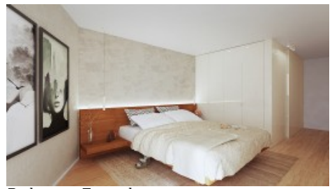
Bedroom - Example