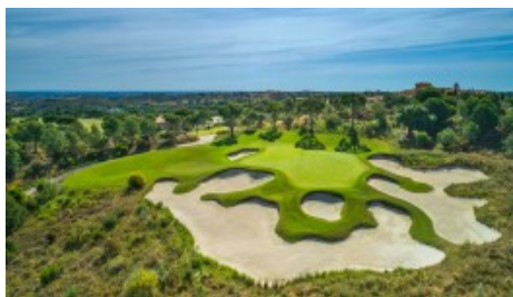
Jack Nicklaus North