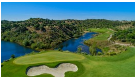
Jack Nicklaus North