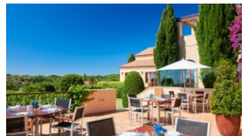
The Grill Terrace