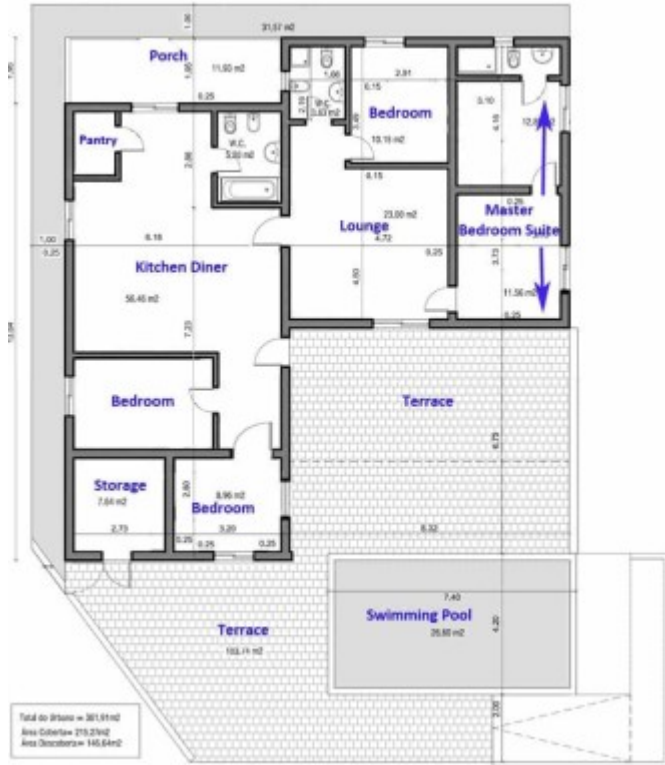
TV2077 Floor plans