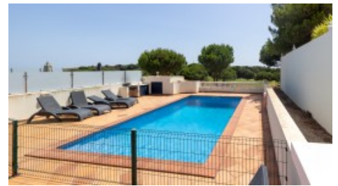
View from Bedroom 1