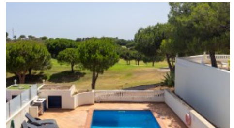
View from Master Room