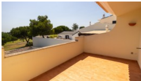
Balcony Master Bedroom