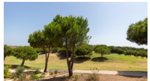
View from Pool