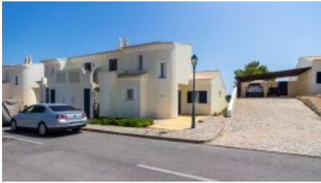
Front of property