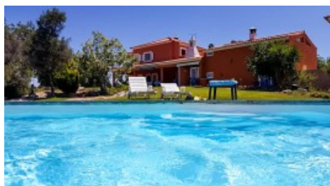
Villa & Pool