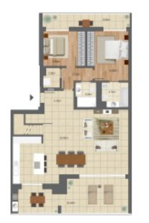
Block B, Apt 4B Two Bedroom Penthouse Floor Plans