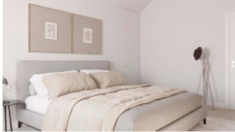
Bedroom - First Floor