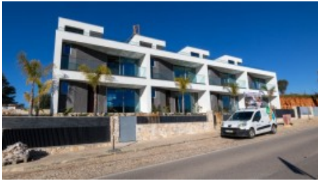
Front of property