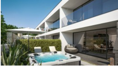
Jacuzzi & Garden