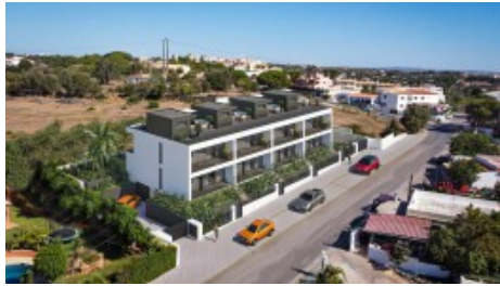
Front of property