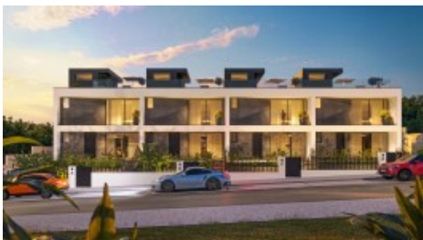
Front of property