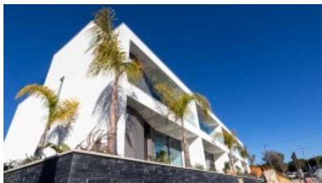
Front of property