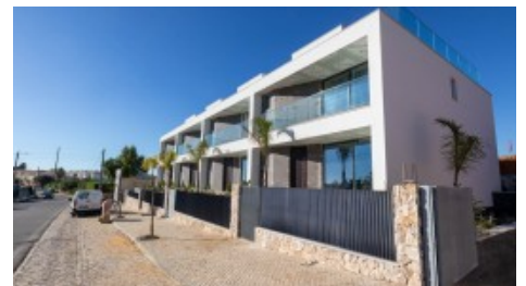
Front of property